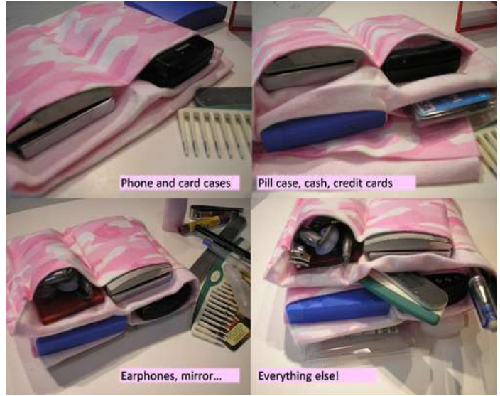
Phone and card cases