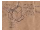
Nifty Salvaged Pocket-Bag (Satchel) or Purse by HAL 9000