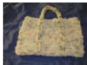
Knit Plastic Bag Handbag by pluralmolecule