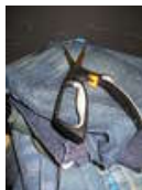
Recycle Denim/Jeans into Reusable parts with no waste. by passionfly