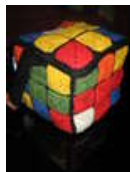
Rubik's Cube Bag (Photos) by zendarenn